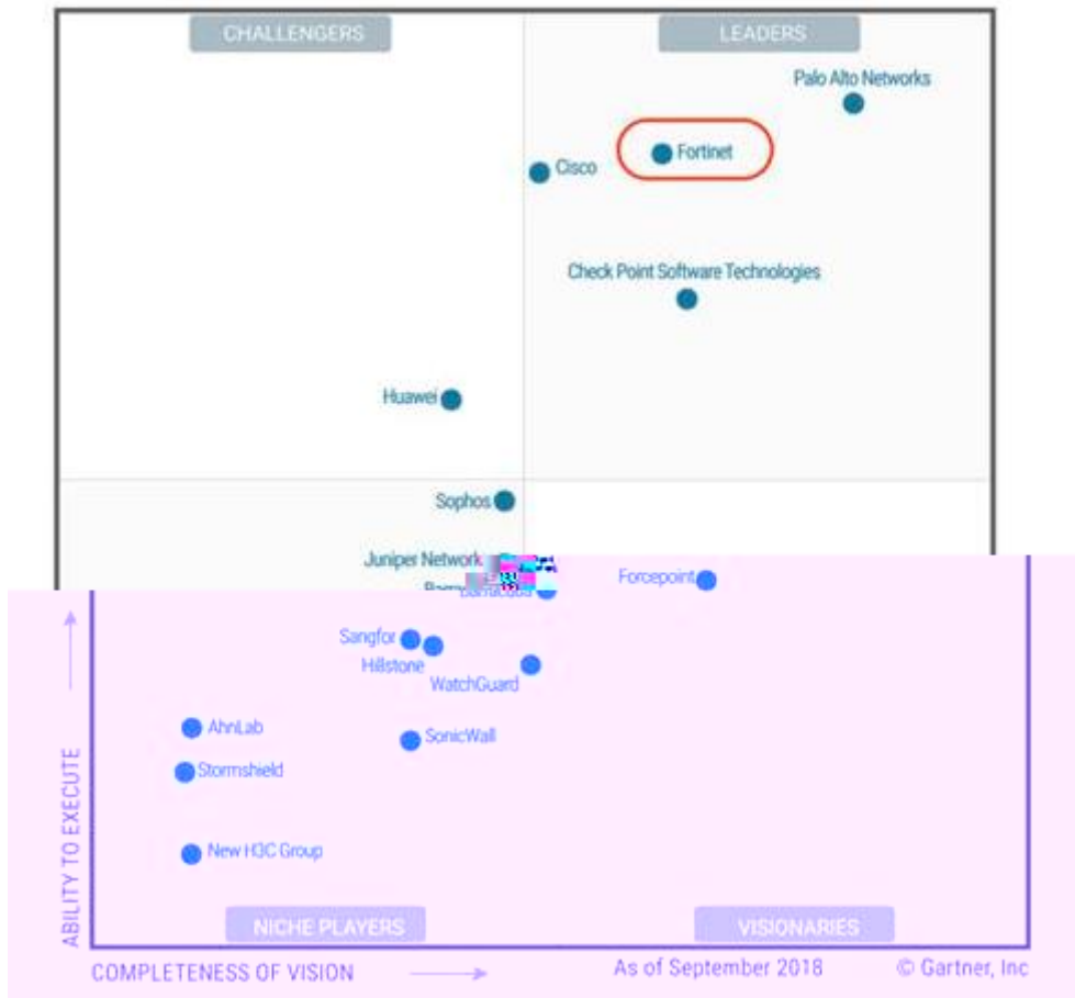
Figure 1. Magic Quadrant for Enterprise Network Firewalls