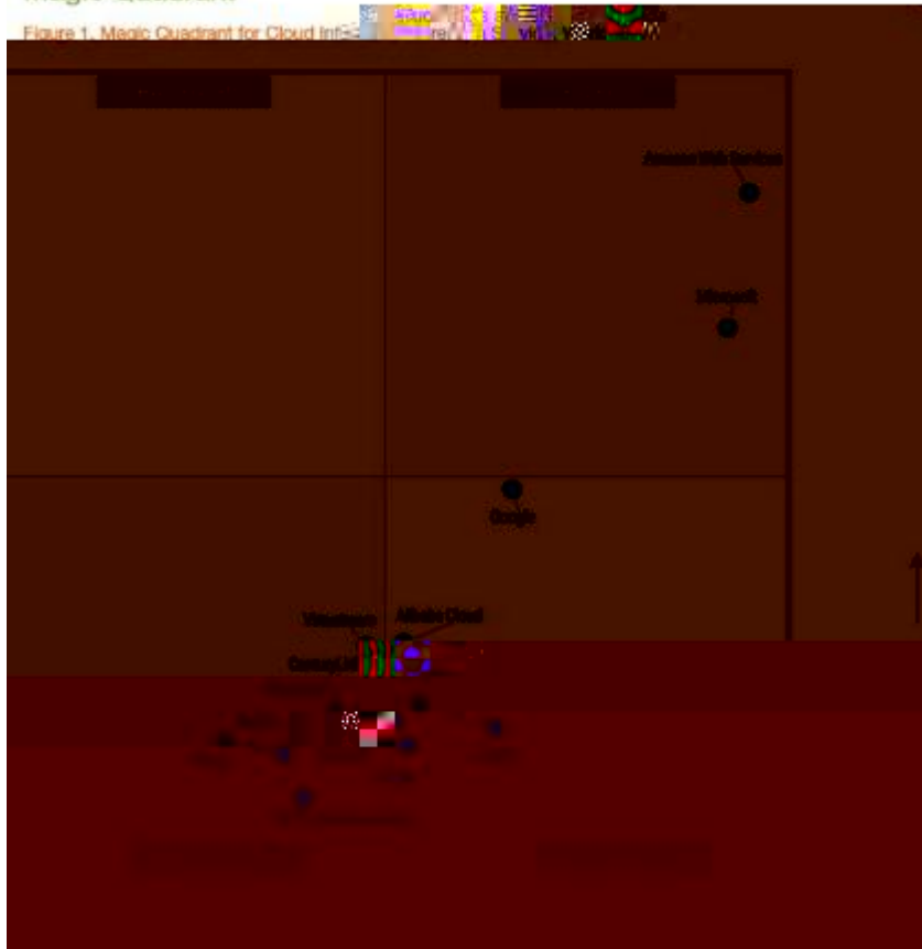
Figure 1. Magic Quadrant for Cloud Infra-